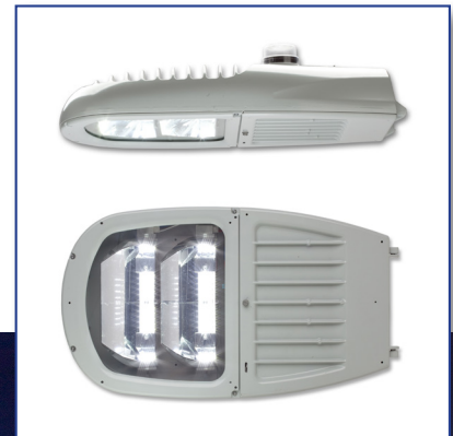
GE Cobrahead Style Roadway Luminaire

** In addition to Total Monthly Cost, the customer is responsible for additional rider charges per the streetlight tariff.