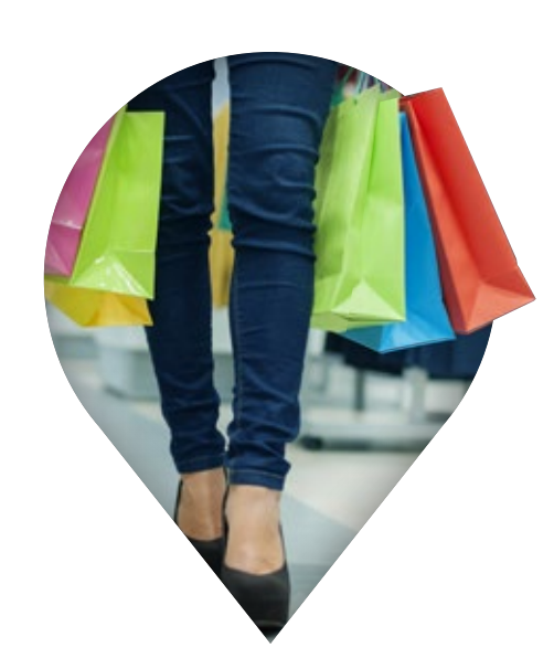
Accelerate your profits with a new revenue stream.