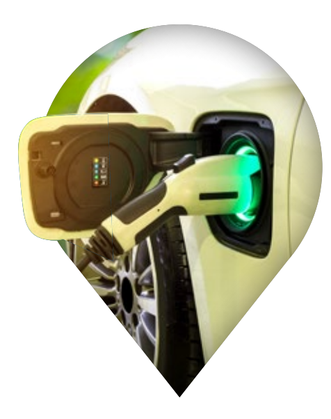
Amplify your reputation as a sustainability leader.