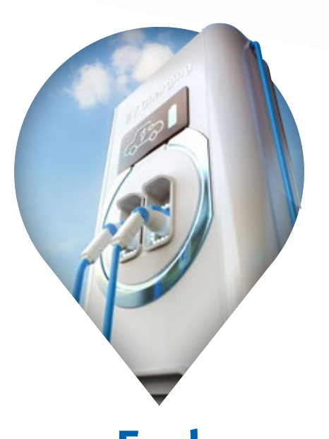
Fuel your property's value and your future.